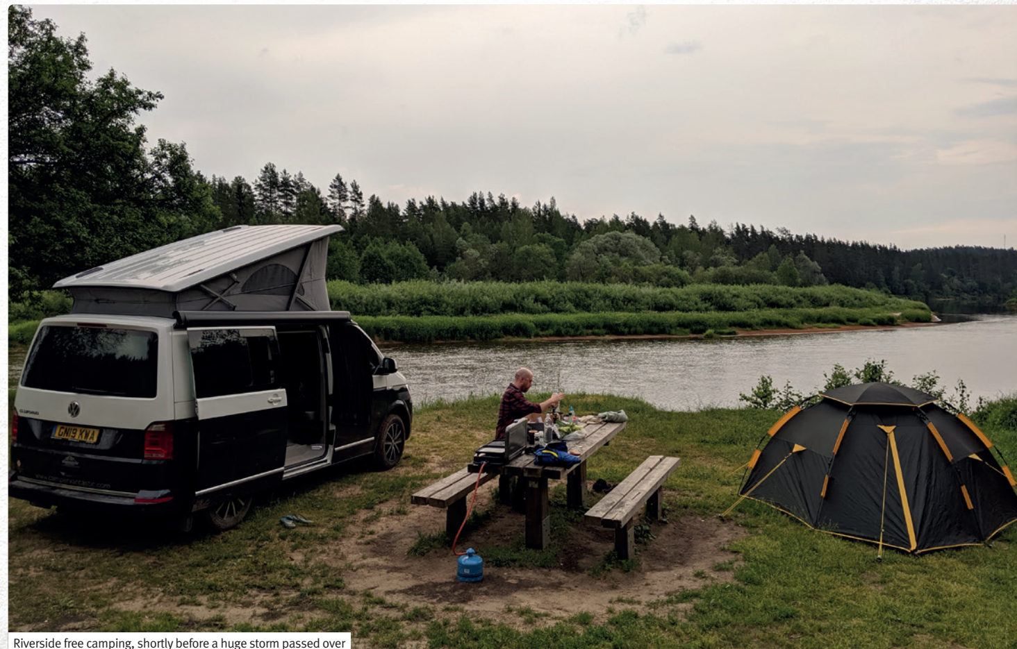
Riverside free camping, shortly before a huge storm passed over