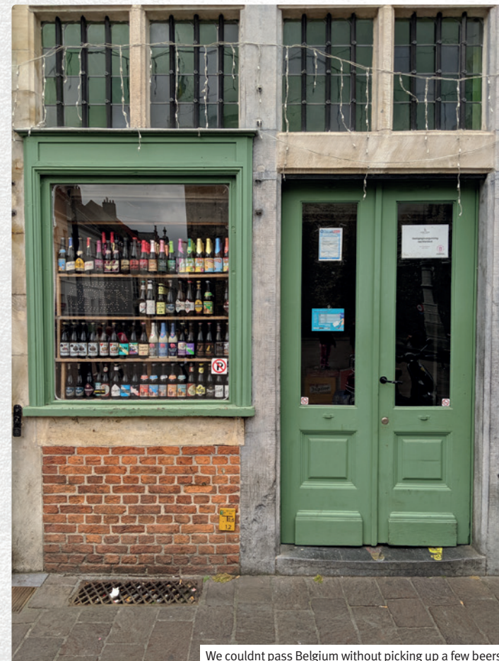
We couldn't pass Belgium without picking up a few beers