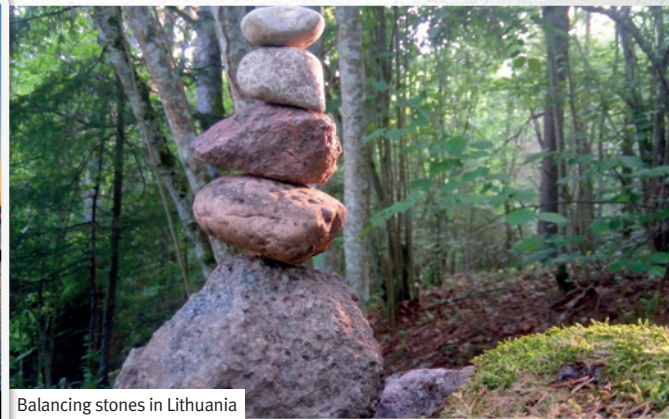
Balancing stones in Lithuania