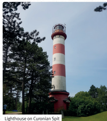
Lighthouse on Curonian Spit

A shout out to DFDS here, Dover-Dunkirk was as smooth as ever, we got the Saturday 4am crossing with the premium lounge upgrade, which was empty, so it felt like we have the boat to ourselves. Kiel - Klaipeda Was the smoothest crossing ever and with the cabins we had the nineteen-hour crossing just sailed by.