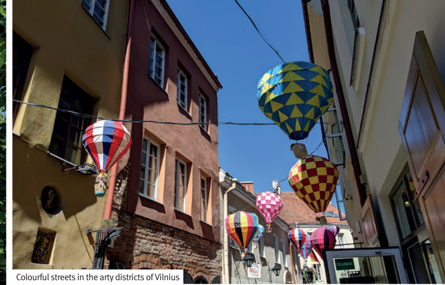
Colourful streets in the arty districts of Vilnius