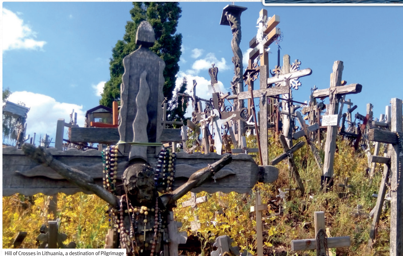
Hill of Crosses in Lithuania, a destination of Pilgrimage