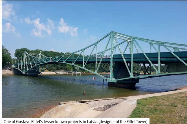
One of Gustave Eiffel's lesser known projects in Latvia (designer of the Eiffel Tower)