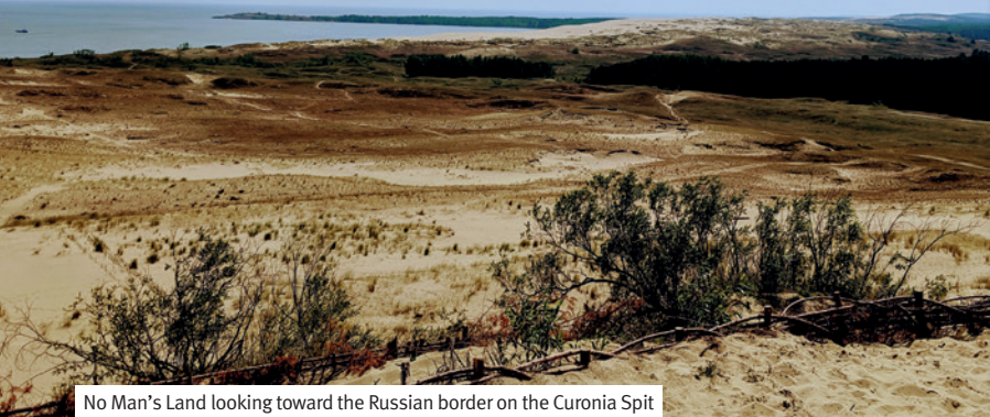
No Man's Land looking toward the Russian border on the Curonia Spit

never far away from a swimming spot. It's also at this point where we realise that we should have brought the canoes along.