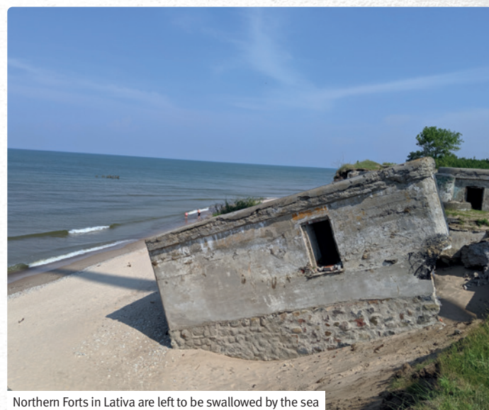
Northern Forts in Latvia are left to be swallowed by the sea

A shout out to DFDS here, Dover-Dunkirk was as smooth as ever, we got the Saturday 4am crossing with the premium lounge upgrade, which was empty, so it felt like we have the boat to ourselves. Kiel - Klaipeda Was the smoothest crossing ever and with the cabins we had the nineteen-hour crossing just sailed by.