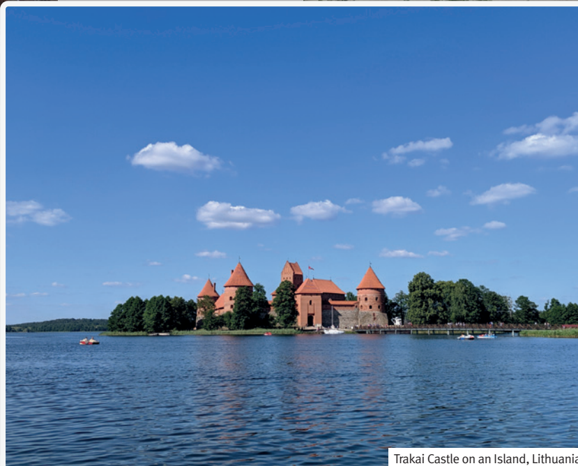
Trakai Castle on an Island, Lithuania