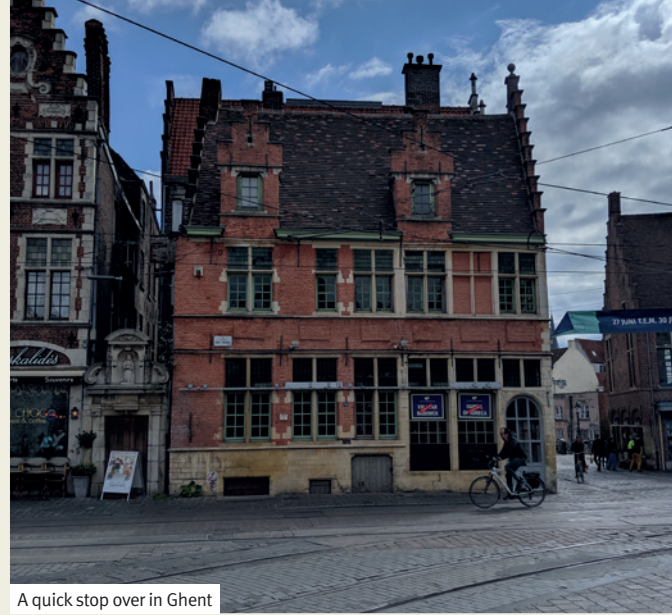
A quick stop over in Ghent

On the way to the Medieval town of Cesis, we find castles to explore before searching the nearby National Park for a place to camp. We discover a spot on the Gauja River, complete with a shelter which came in handy when two huge thunderstorms pass over