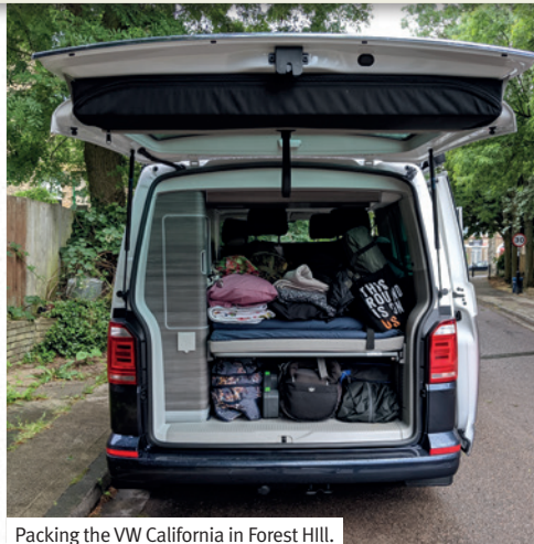
Packing the VW California in Forest Hill.

Wild/Free camping is tolerated and even encouraged in the Baltics, National and regional parks all have picnic areas and toilets. One we found in Estonia even had a small hut, fireplace and free wood and an axe we could use, building a campfire really helped with the mozzies! We travelled in June, so the fleets of motorhomes weren't out in force, most of the places we stayed were empty and we weren't disturbed.