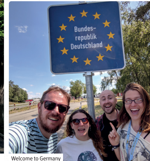
Welcome to Germany