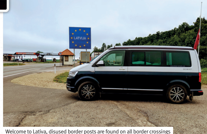
Welcome to Latvia, disused border posts are found on all border crossings