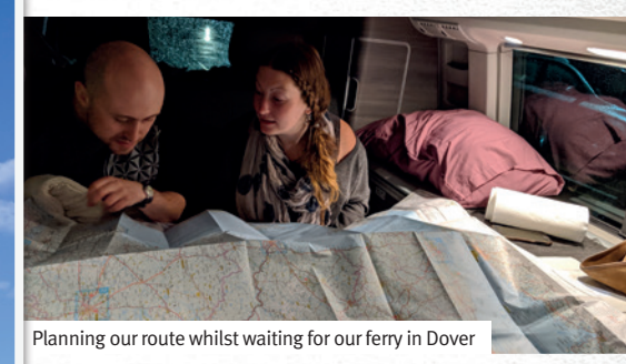
Planning our route whilst waiting for our ferry in Dover