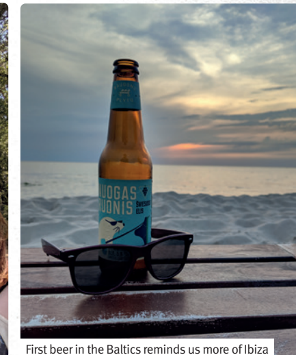
First beer in the Baltics reminds us more of Ibiza