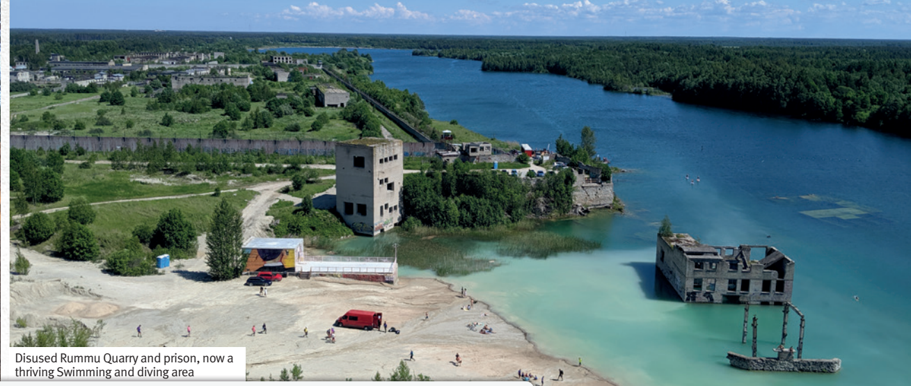
Disused Rummu Quarry and prison, now a thriving Swimming and diving area

After stopping over near Arnhem in the Netherlands we make our tracks through Germany and really get to see how the 204PS T6 holds up on the Autobahn, with the accompanying Kraftwerk album on of course. After a quick stop for some Curry Wurst and a stein of local beer in Kiel, we head for the ferry port. We board in the late afternoon, just in time for the bar to open and have a few drinks with the long-distance lorry drivers until the early hours. After a good night's sleep, we wake up and we're already halfway across the Baltic Sea, just in time for DFDS to serve up a great breakfast buffet, which