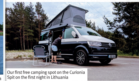
Our first free camping spot on the Curonia Spit on the first night in Lithuania